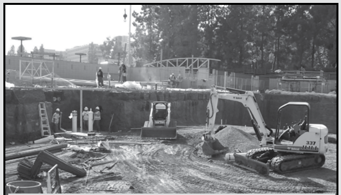
UCLA began construction of the aquatic center in July 2008

The $10-million project includes a clubhouse that will contain locker rooms, coaches' offices and meeting rooms which currently do not exist for intercollegiate athletics. The Spieker Aquatic Center will be a lighted facility and will hold 800 spectators in the permanent grandstand. For large-scale events, UCLA will have the ability to seat an additional 1,700 spectators in temporary seating.