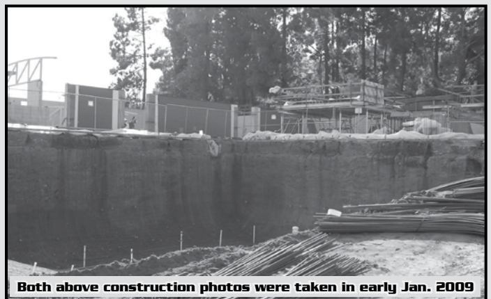
Both above construction photos were taken in early Jan. 2009